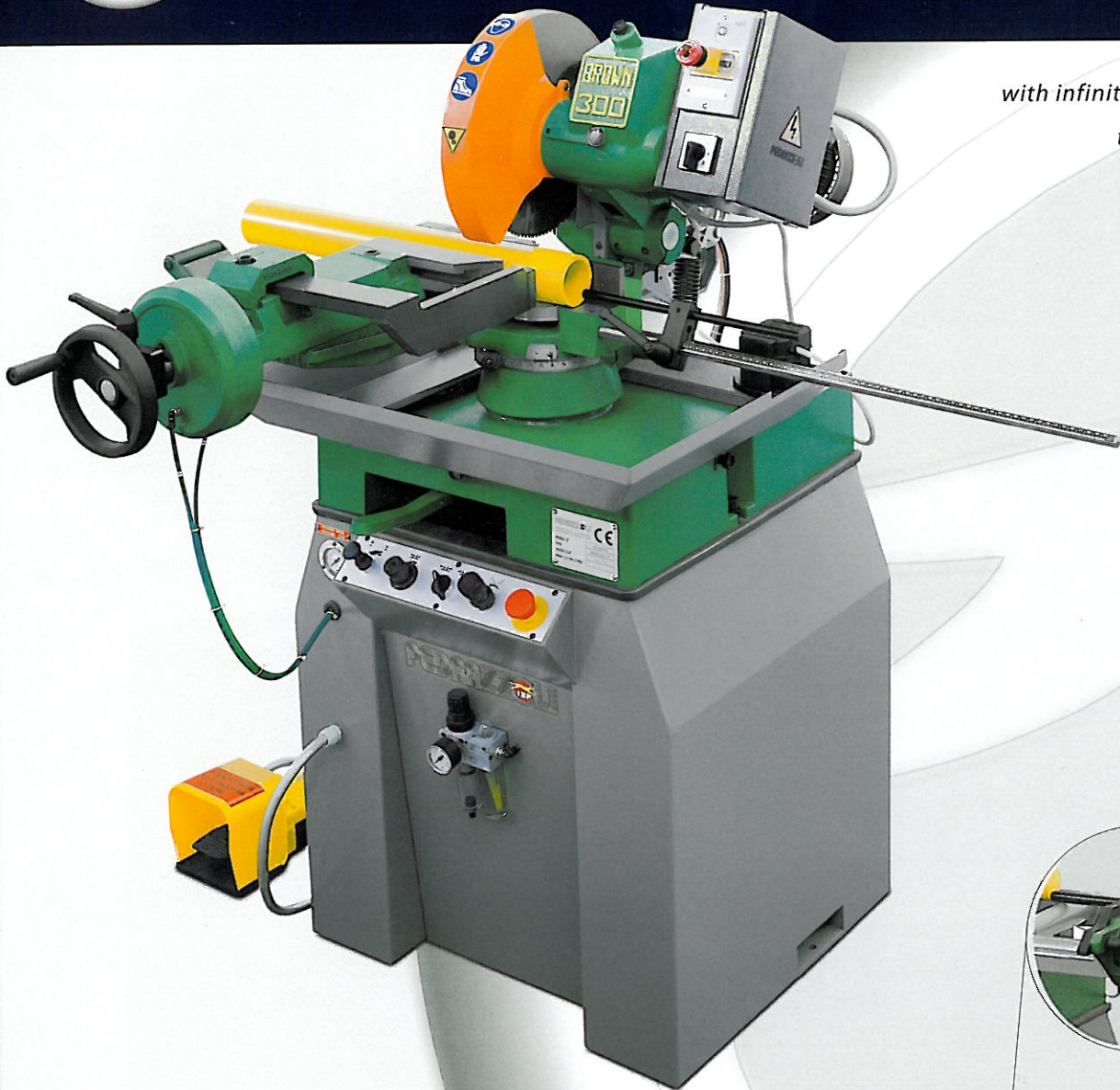
LOADING ROLLER TABLE (ACCESSORIES AVAILABLE UPON REQUEST)

with infinitely variable blade speed to cut all types of metals